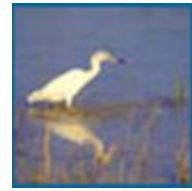
North East Lindsey IDB