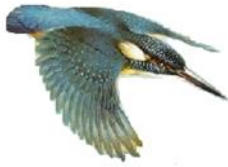
Witham First District IDB

Four independent statutory Land Drainage and Flood Control Authorities working in partnership. Witham House, J1 The Point, Weaver Road, Lincoln LN6 3QN. Tel: 01522 697123